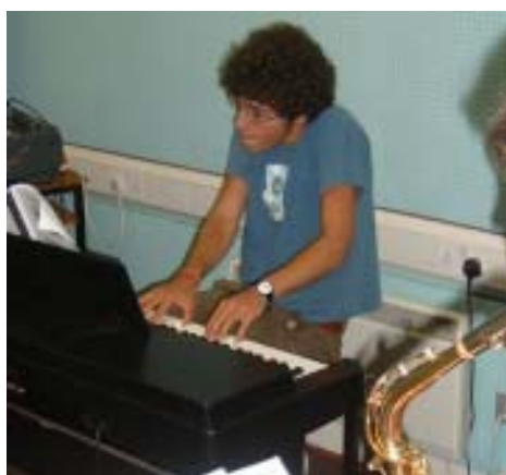
Cookin' at 80 Queen Street!